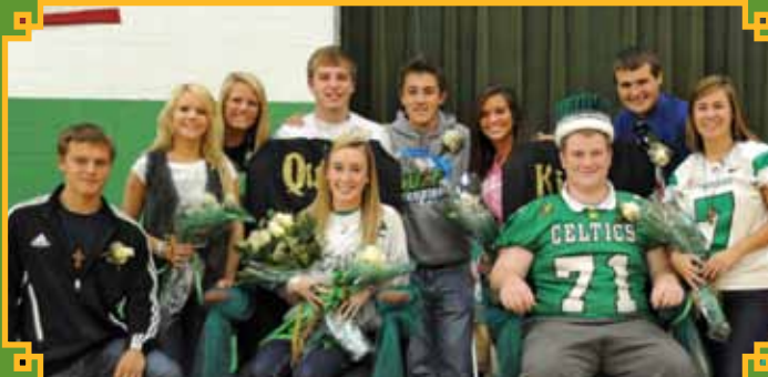
2011 Providence Catholic Homecoming Court

Furthermore, the PCHS community gathered for the homecoming football match-up where the Celtics defeated the St. Ignatius Wolfpack 54-6. On Saturday, students attended the Homecoming Dance, which featured a “Born to be Wild” theme.