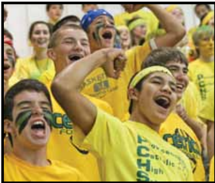
Freshmen rise to their feet to support their fellow classmates as they compete at the dodge ball event.

Harvest Drive was initiated in 1968 to raise funds for the school, which was facing a financial crisis. Faced with the prospect of closure, the school sponsored a car raffle and carnival that generated $15,000 the first year and $32,000 the following year. Pleased by the results of this fund-raising effort, the officials decided not to close the school. Since then, this three-week fundraiser has grown to generate more than $400,000 annually to help offset the difference between tuition and the cost of operating the school.