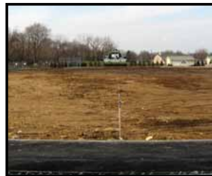
The field is nearing final excavation to prepare for turf installation this Spring.