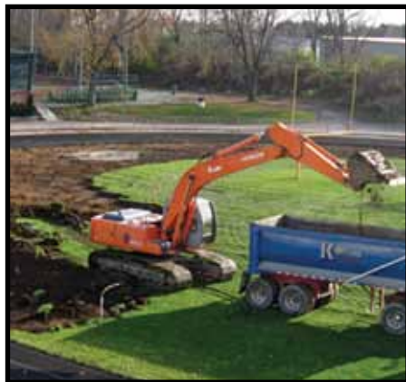
Excavating of Matt Senffner Field began in mid-November.

will transform the stadium into a venue for all Providence Catholic students to use throughout the year. Physical education classes will use the field almost every day the weather permits. Additionally, the football, track, cross country, and soccer programs will utilize the new field and track for games, meets and matches.