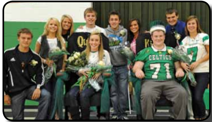
2011 Providence Catholic Homecoming Court

gathered for the homecoming football match-up where the Celtics defeated the St. Ignatius Wolfpack 54-6. On Saturday, students attended the Homecoming Dance, which featured a “Born to be Wild” theme.