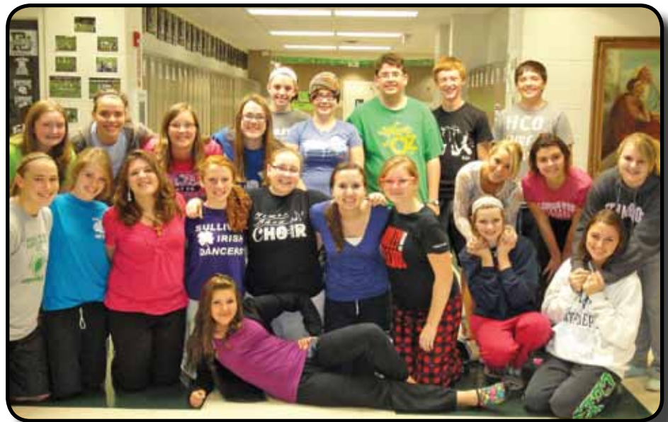
The Sleeping Beauty cast and ensemble take a break from rehearsal to pose for a photo. *If you receive this publication before November 3-6 and would like to attend a performance, please visit the PCHS website for more details.