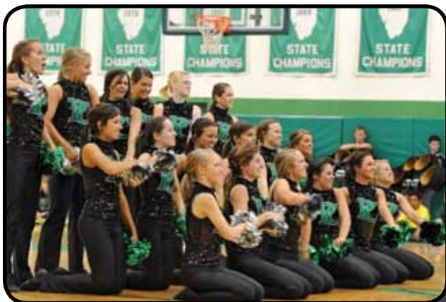
The Pom Pon squad amaze the PCHS community with their dance routine.