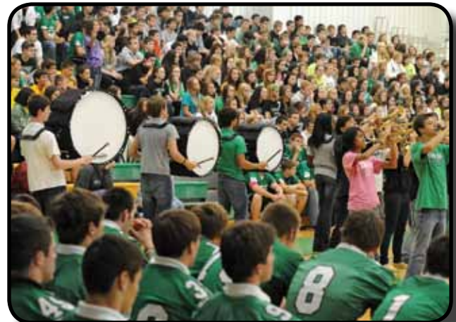
The Band & Color Guard perform the “Fight Song” and excerpts from their half time show.