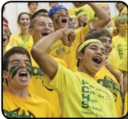
Freshmen rise to their feet to support their fellow classmates as they compete at the dodge ball event.