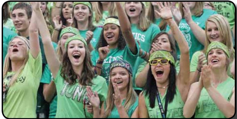
Juniors cheer on their classmates during the obstacle course competition.

To celebrate this success, the PCHS family enjoyed the traditional spirit-filled Harvest Drive Olympics at the conclusion of this drive. Several events took place, including dodge ball, tug-of-war and an obstacle course. The Olympics concluded with the annual pie-in-the-face-of-a-faculty-member;