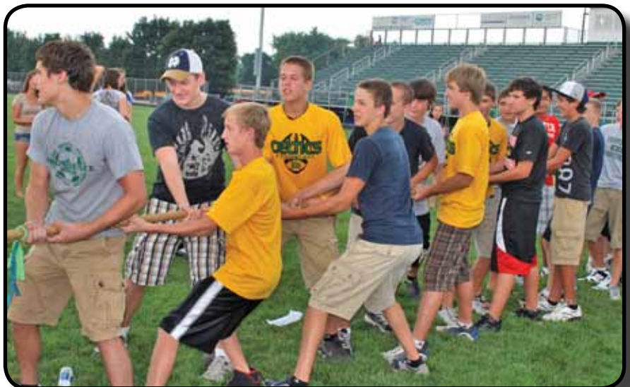
Incoming freshmen boys battle for the tug-of-war title at the annual Freshmen Family Picnic, which took place in early August. Nearly 550 students and their families attended.