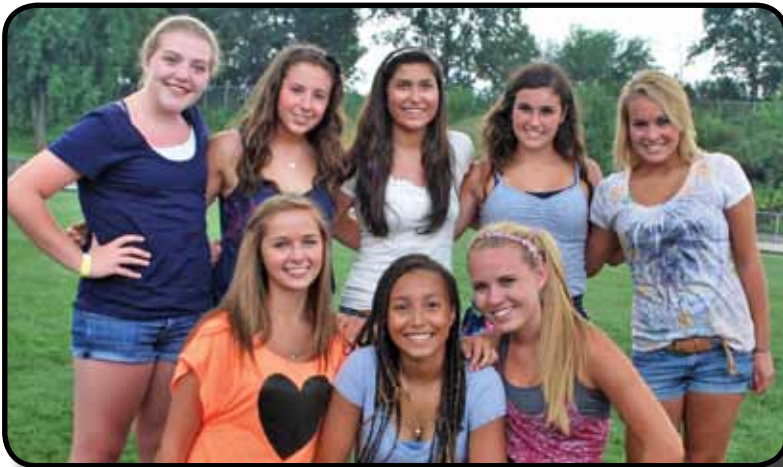
Incoming freshmen girls take a moment to smile for the camera at the Freshman Family Picnic.

Nearly 300 freshmen were welcomed into the Providence family during the school's annual Freshmen Retreat in mid-August. The goal of this retreat was not only to welcome new students, but to introduce them to the mission of Providence Catholic, which is to love God and others.