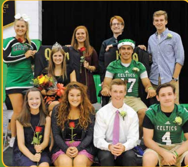
2016 Homecoming Court

The Celtics played Brother Rice at the football match up. The week's festivities concluded with the Homecoming Dance, which had the theme "Under the Sea".