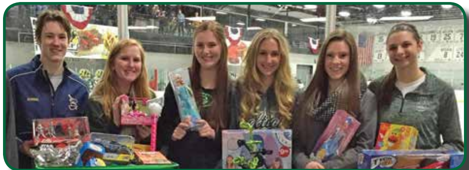
PCHS students, families and alumni donated toys to families in need at a Celtic Hockey Toy Drive in late December.